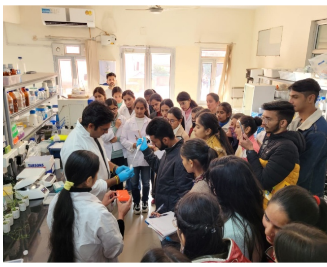
Page | 18